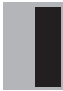
Half Page Upright 297mm x 105mm