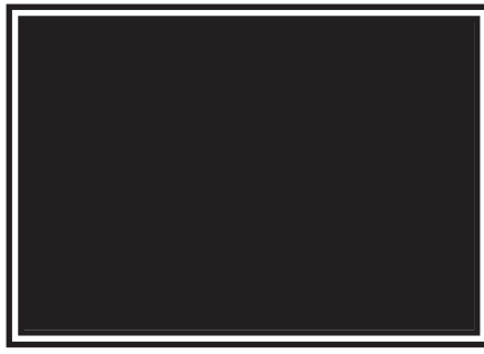
Double Page Spread Bleed 426mm x 303mm (includes extra 3mm all around)