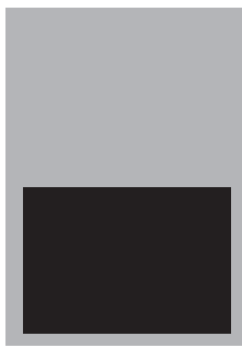
Half Page Landscape 105mm x 148.5mm