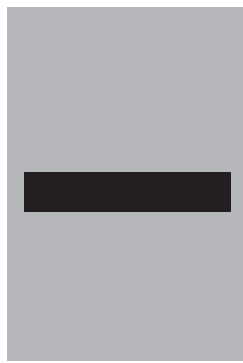
Middle Advert 1200px x 200px

We provide solus emails. Why not send our subs an email?