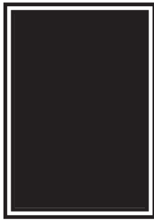
Full Page Bleed 216mm x 303mm (includes extra 3mm all around)