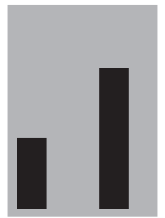
Regular Directory 47.75mm x 92.5mm Double Directory 47.75mm x 189.4mm

All artwork for advertising and editorial should be high resolution 300 dpi and of suitable dimension size, supplied as a JPG, EPS or PDF file; and where possible for logos and illustrations as a vector Adobe Illustrator file. It is also preferred in the case of advertorial pages and company specific branding that fonts are supplied too.